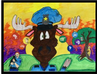
3 rd Place: Traci Green

Middle School students participated in the international Peace Poster Contest which is sponsored by our Indianola Lions Club. Creating peace posters gives students the chance to express their visions of peace and inspire the world through art and creativity. Congratulations to the following IMS students who placed locally: